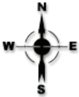
Sketch Floor Plan

Land Size _____ No. of Rooms _____ Construction - Roof _____ Walls _____ Water Pressure _____ No. of Bathrooms _____